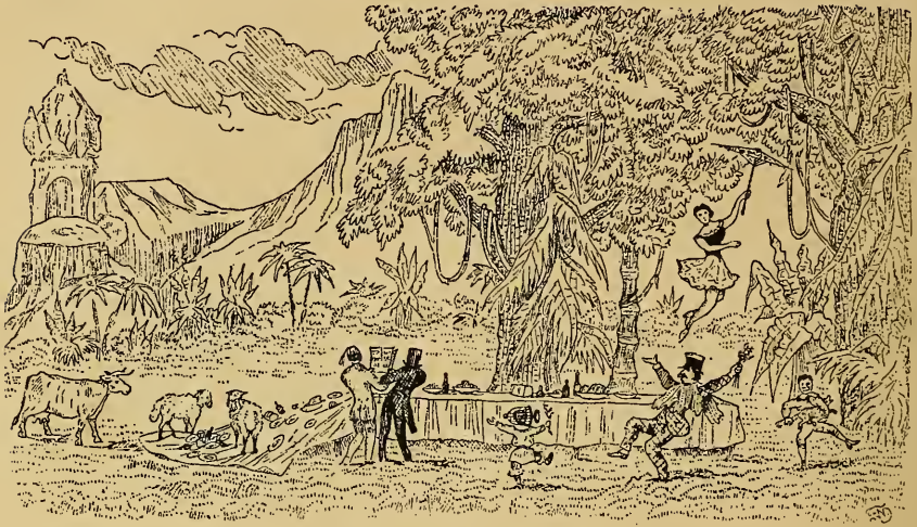
EFFECT OF THE MINT-JULEP BED.

cadillo runs out with shrill cries. This animal is harmless, except when it attacks you. Then it becomes very dangerous. Its flesh is, when cooked, tender and savory, and will make a capital dinner for us to-day."